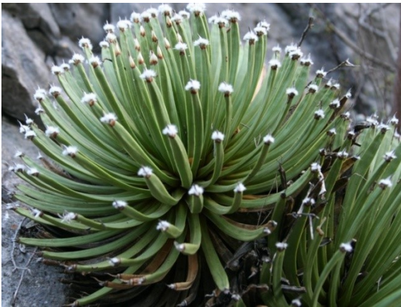
The rare and expensive Agave albopilosa

Agaves , like the Cacti , are entirely new world in origin, although many members have been naturalized around the world. Agaves are native to Southern North America, Mexico, Central America, Northern South America and the Caribbean. A few species are native to the deserts of Southern California. There are roughly 200 species of Agave and countless varieties and cultivars, with new species being discovered regularly. Some species are so common in