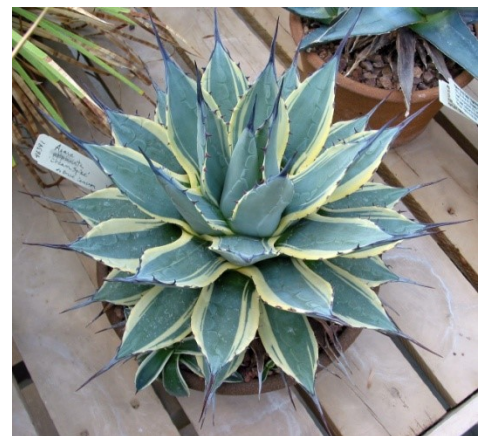
Agave applanata 'Cream Spike'