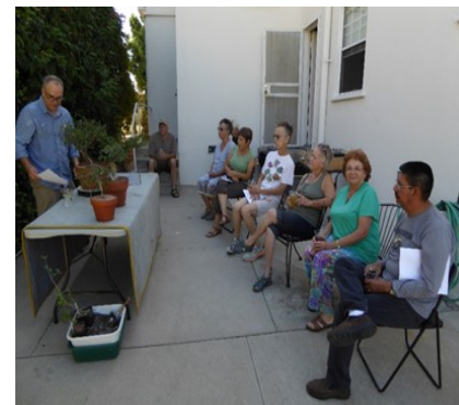
LACSS Club Members