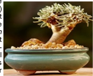
Avonia alstonii ssp. quinaria

some species such as C. pellucidum are so small that you could have upwards of 100 heads in a three inch pot! Many species of Lithops work well too. Also consider some of the mesembs that aren't living stones types such as Titanopsis or Aloinopsis species. Outside mesembs, consider some of the smallest Crassula , Haworthia , Sedum , or Avonia . These are just suggestions, but if you have a plant that looks good and proportional in a three inch or smaller pot then you have a miniature!