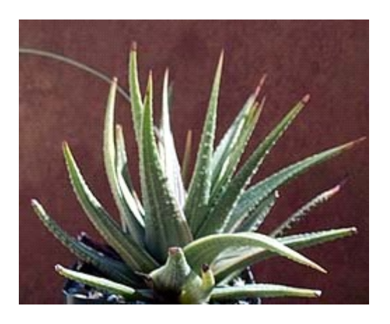
Haworthia attenuata x pumilla variagate

Euphorbia - A number of columnar variegates are available, E. ammak , being the one most often seen. There are also some cristate and monstrose variegates as well.