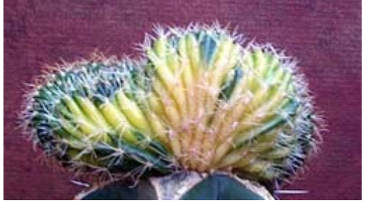
Variegated Monstrose Lobivia

Many of these are artificially propagated by grafts. The famous 'Red Caps' and 'Yellow Caps' are Gymnocalycium or Lobivia variegates that have no chlorophyll at all, and live only by being grafted onto a root stock.