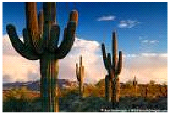
Carnegiea gignatea forest

One of the more remarkable instances of endemic monotypic cacti is in the Sonoran desert where Carnegiea gigantea forests (Saguaro) are found. Originating in the dry climate condition of the Sonoran Desert, these specimen dominate the landscape.