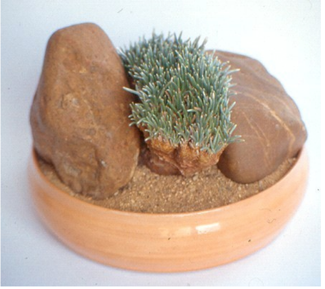
Avonia quinaria ssp. als

The genus Avonia originates in South African in Great Namaqualand andBushmanland. Avonia form a woody caudex, approximately one inch high, which expands as the plant matures. Leaves emerge from the top of the caudex. This plant typically requires partial shade in cultivation and can be sensitive to frost or colder conditions. Although listed as a deciduous plant, many specimen retain their leaves all year long. Flowers are carmine red, white, or pink. Avonia flowers are self-fertilizing and can generate seed if you have only one plant.