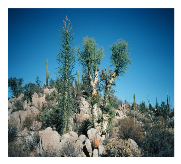
Catavina—Boojum (Fouquieria columnaris) and Elephant Tree (Pachycormus discolor) grow side by side