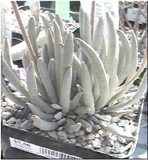
Senecio scaposus

Senecio and Othonna are two plant genera in the Compositae family. Both genera are distinguished by the fact that they are winter growers; their growing season is during our winter in Southern California. The two genera share a common ancestry with a distinction that it shares with such common plants as Sunflowers, Asters and dandelions. Senecio is a very large and cosmopolitan genus, with species in most of the tropical and sub-tropical regions of the world.