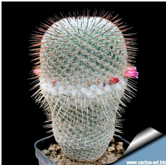
Mammillaria crucigera subsp. tlalocii

A distinguishing feature of all Mammillarias is that flowers appear at the point of two tubercles and form a ring around that particular stem of the plant. Flowers appear on the previous year's growth. A smooth brilliant red club-shaped berry appears if flowers are fertilized.