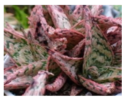
Aloe (hybrid) Pink Blush