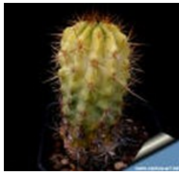
Euphorbia Susanne "lutea"