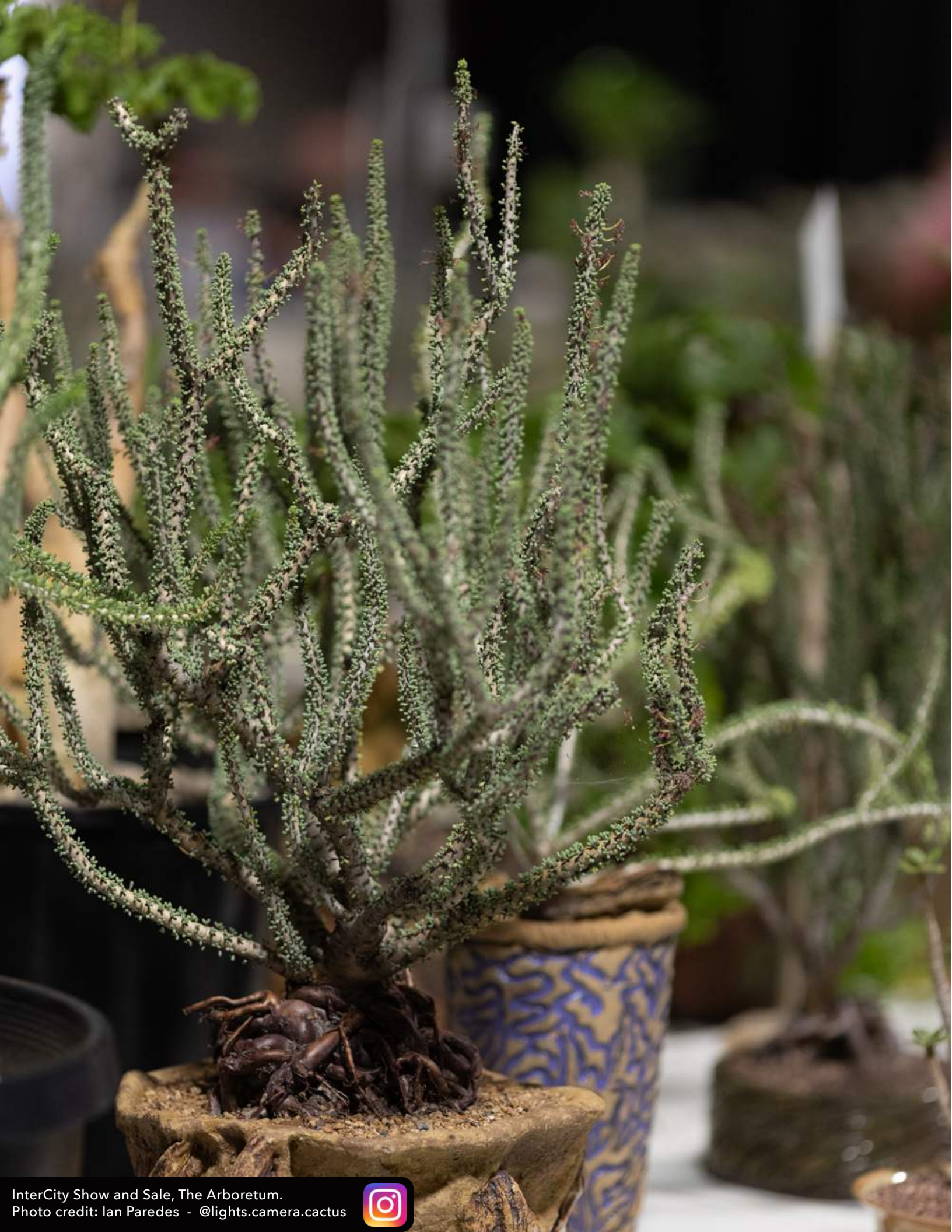
InterCity Show and Sale, The Arboretum.