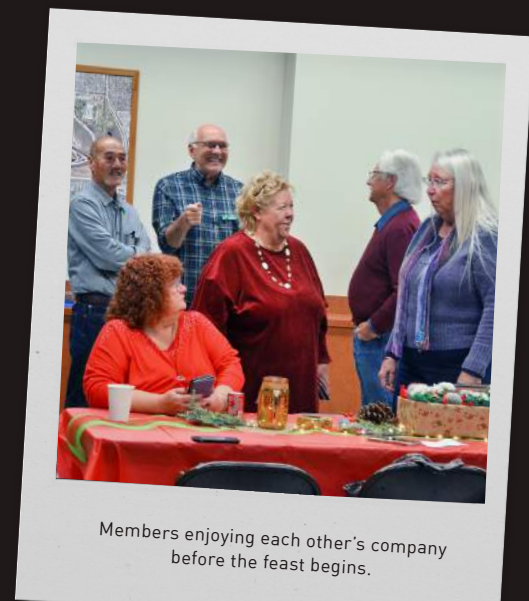
Members enjoying each other's company before the feast begins.

Once we determined that we could eat no more, we began the festivities with a Silent Auction of 10-15 plants.