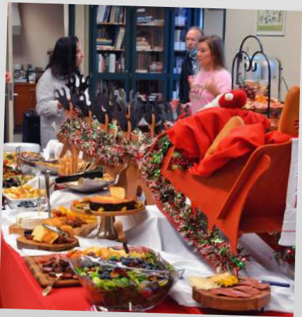
The impressive and festive spread of food!