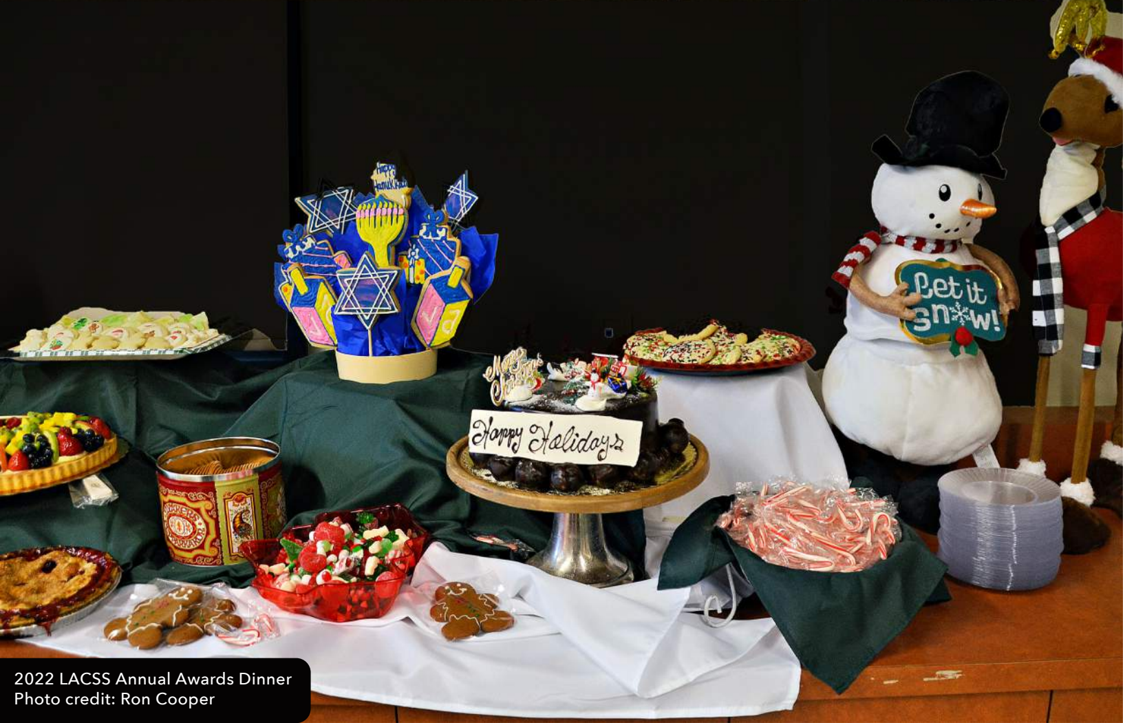
2022 LACSS Annual Awards Dinner