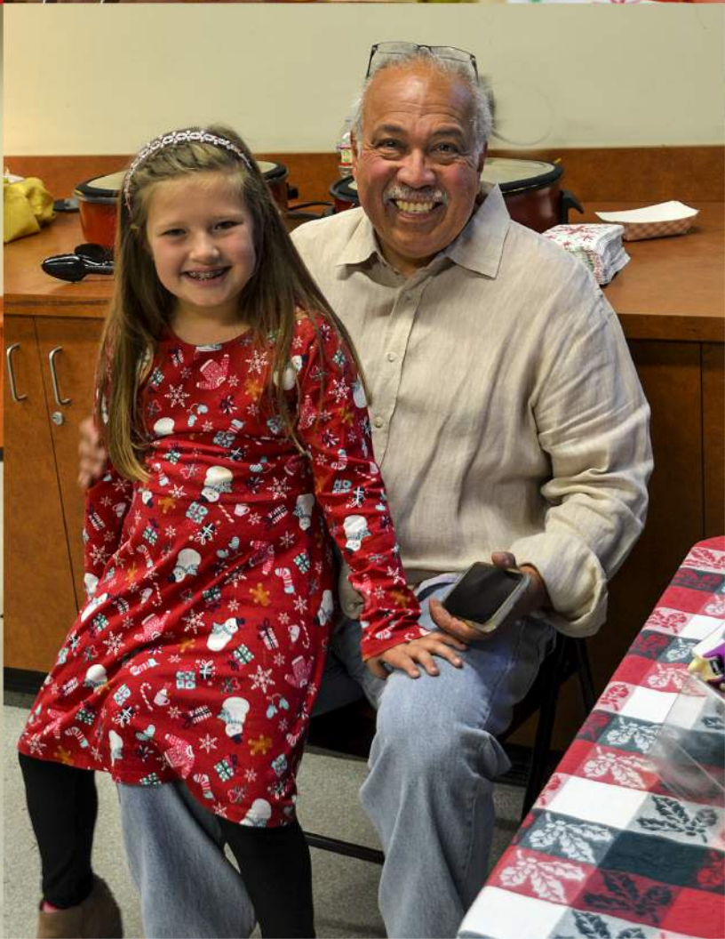
2022 LACSS Annual Awards Dinner