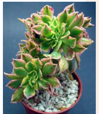
Aeonium 'Sunburst' Crest