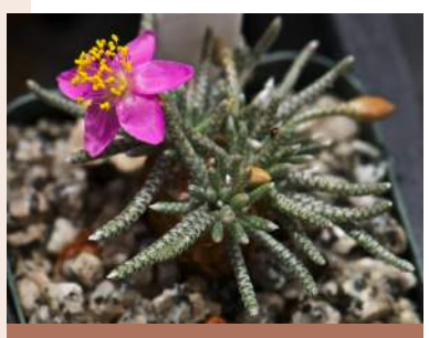
Avonia alstonii ssp. quinaria

Another example would be a Bursera microphylla, the Elephant Tree, which canform a huge shrub or small tree. It is often grown as a caudiciform bonsai just a couple feet tall. That plant has been dwarfed but it still is not a miniature!