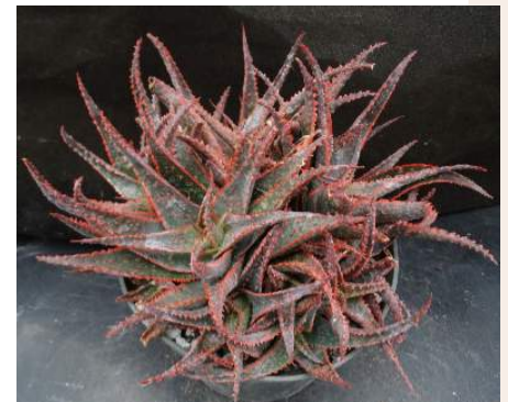
Aloe x 'Christmas Carol'