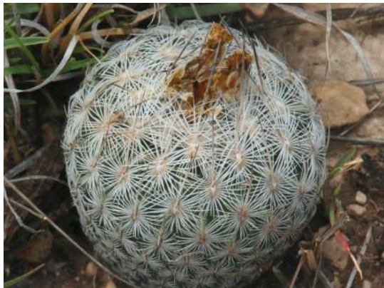
Gymnocactus sp.nova We discovered this new species in 2019. It has not yet been described.