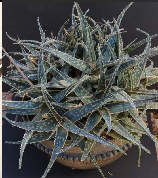
JIM + ROXIE ESTERLE ALOE HYBRID