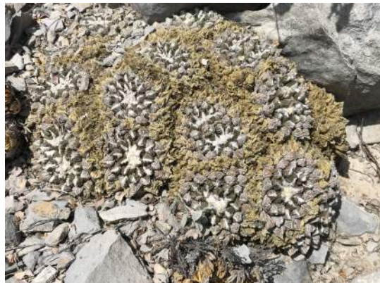
Ariocarpus fissuratus in the Chihuahuan desert.

Mexico is considered by many to be one of the richest regions in the world for cacti. From the United States to the north, to its southern border of Guatemala, there are an amazing number of genera and species to be found. These range from the tiny Turbinicarpus to the giant Pachycereus . Within the reaches of Mexico, there are many diverse geologic environments. These habitats vary from the coastal and inland low lands to its many high mountain niches. For almost 50 years, I have been lucky enough to have traveled most all of Mexico. Thus, my favorite regions for exploring include the most popular Baja California, to the mysterious Sierra Madre Occidental, and the succulent rich Sierra Madre Oriental. It is from these famous territories that the majority of the highly desired collector's taxa are to be found.