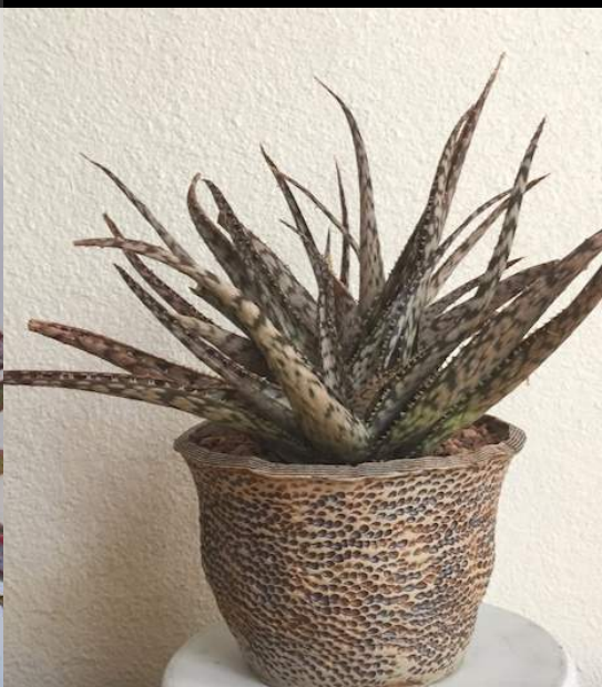
GRETCHEN DAVIS ALOE 'LIZARD LIPS'