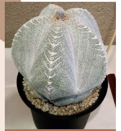
Astrophytum myriostigma 'Onzuka'

region with essentially no winter rainfall. Rain is concentrated in the summer months