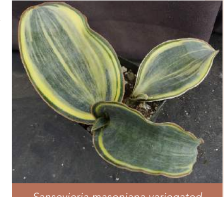
Sansevieria masoniana variegated

Cultivation of most species is quite easy. They thrive in most any well drained potting mix. Outdoors they can grow in similar light conditions as Gasteria and Haworthia (bright shade, maybe some morning sun) or even shadier spots. They do well in ground, though they don't like being in a cold and wet for excessive periods. Propagation is simple. Either divide a large plant or grow new plants from leaf cuttings. Do note that leaf cuttings of variegated plants virtually always produce regular, non-variegated plants.