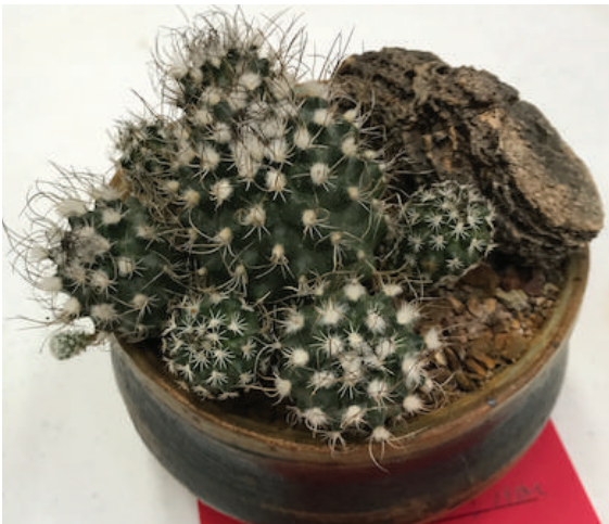
TURBINICARPUS PSEDUMACROCHELE COLLIN O'CALLAGHAN & KIMBERLY TONG