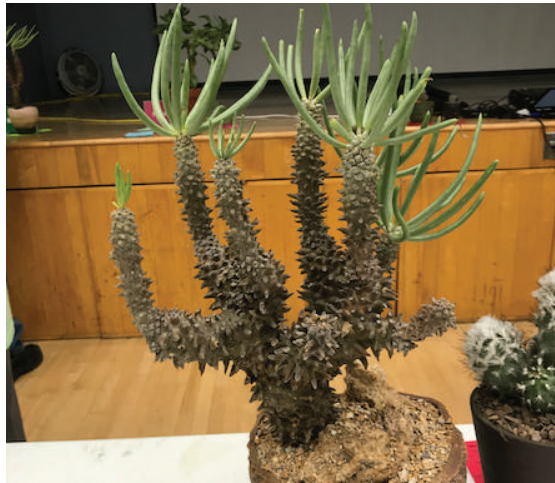
TYLECODON WALICHII COLLIN O'CALLAGHAN & KIMBERLY TONG