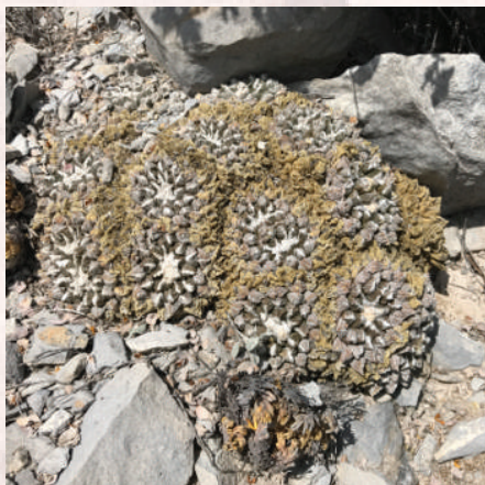
Ariocarpus fissuratus in Big Bend National Park.

There are many cacti and other succulents that are becoming very valuable