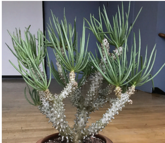
TYLECODON WALICHII