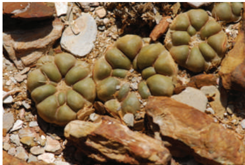
Cintia knitzii , in habitat.

The countries that are most affected with cactus and succulent problems are: Brazil, Bolivia, Chile, Kenya, Madagascar, Mexico, Namibia, Socotra, Somalia, South Africa, Peru, and the United States. All of these countries have well intended conservation programs, but most do not have the funds available to properly enforce their laws or monitor their endemic species. In this presentation you will see many of the cacti and other succulents that are considered threatened or endangered, and what has happened to place them in this perilous position.