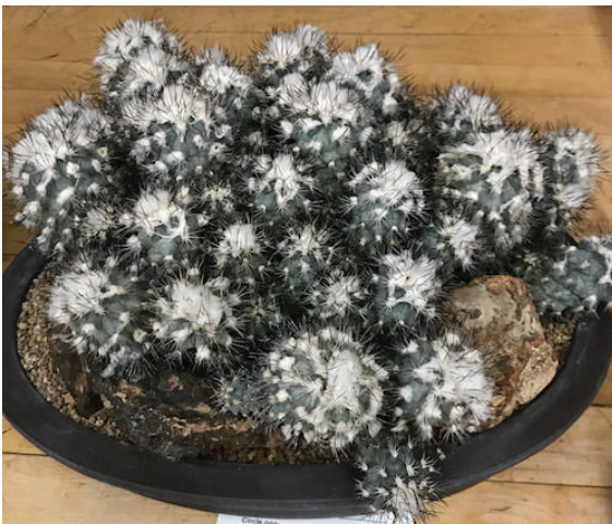
TURBINICARPUS GEILSDORFFIANUS