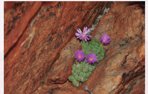
Conophytum sp. from Namibia. The Conophytums are heavily threatened by large scale commercial collecting.

Never has there been a time when conservation of our cacti and other succulents has been more urgent! Due to many factors, our precious succulents, as well as many other plants and animals, are now facing severe problems. When traveling around the world in succulent rich regions, I have observed an amazing increase in the devastation of habitats and the illegal removal of many rare and endangered species of cacti, succulents, and other plants and animals. Not only are we losing these very special and unique plants, sadly enough, we are aggressively destroying many valuable and irreplaceable habitats. Our desires to urbanize and agriculturally develop great numbers of virgin environments have only produced severe ecosystem imbalances, thus the extinction, at a most rapid rate, of many of the world's most beautiful and fascinating plants and animals.