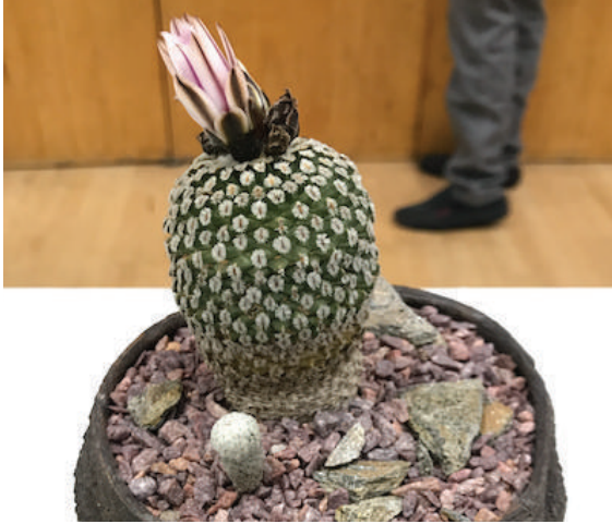
TURBINICARPUS PSEUDOPECTINATUS EMILY AKERS + JOHN GIESING