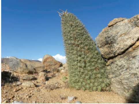
Euphorbia multiceps , threatened from extreme drought in South Africa.

popular method of acquiring merchandise, our rare and endangered cacti and other succulents are being sold internationally with very little, if any, controls being enforced.