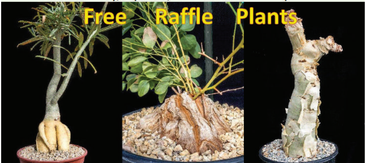
Adenium somalense 23" tall

At the Skillin Ranch in Arroyo Grande, San Luis Obispo Co. Saturday, April 4, 10:00 am – 3:00 pm