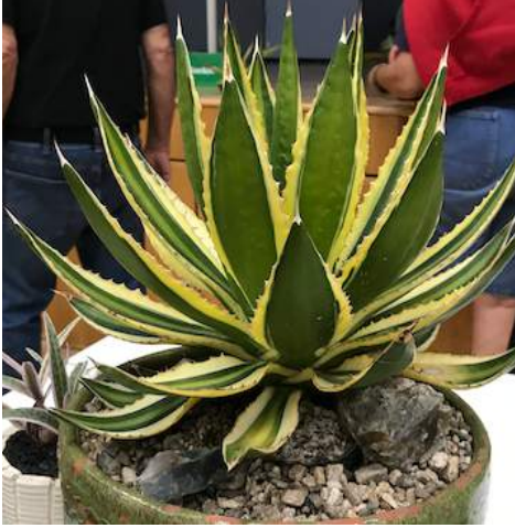
AGAVE LOPHANTHA ANGELA CLUBB