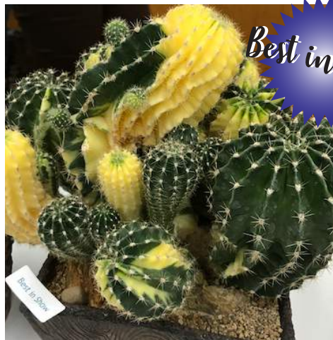
ECHINOPSIS SP.