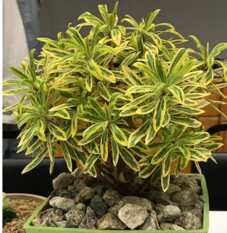
EUPHORBIA ASCOT MARTINII AL MINDEL