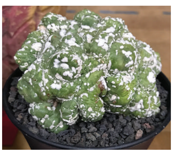
ASTROPHYUM ASTERIAS MONSTROSE COLLIN O'CALLAGHAN & KIMBERLY TONG