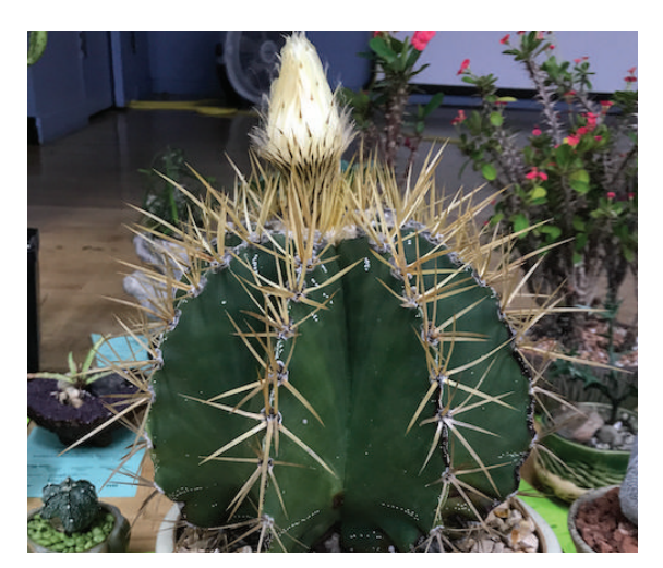
ASTROPHYTUM ORNATUM NICK STEINHARDT