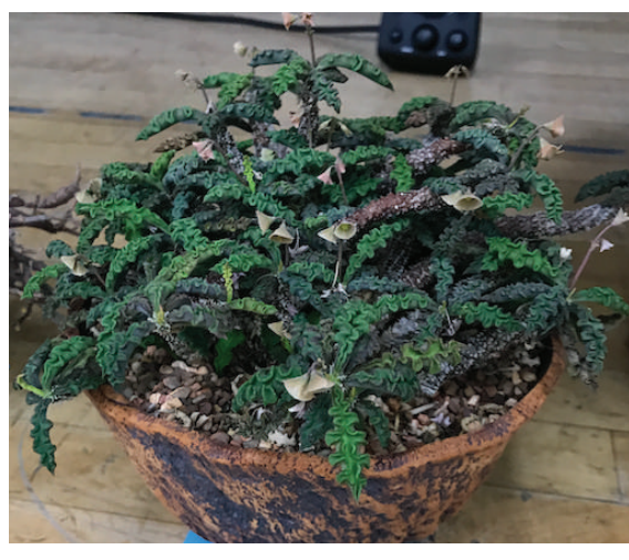
EUPHORBIA FRANCOISII JIM & ROXIE ESTERLE