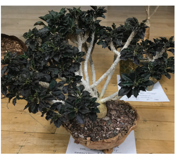
EUPHORBIA AMBOVOMBENSIS KAREN OSTLER