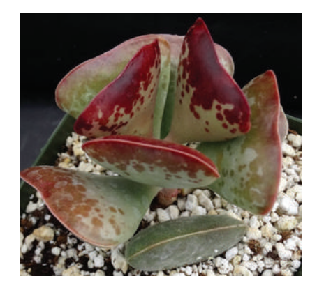
Adromischus trigynus "Coral Hearts"

season water when nearly dry (they even appreciate the occasional rain storm) and give them bright light but not too much full sun. They like it on the shadier side, but not too dark as you do want to maintain the color.