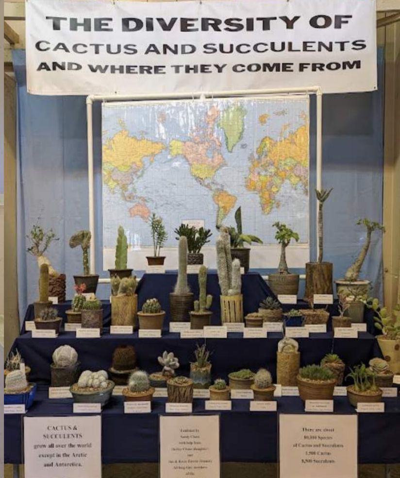
The final product