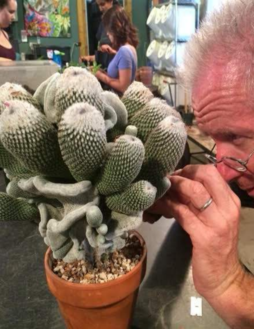
Propagation photos