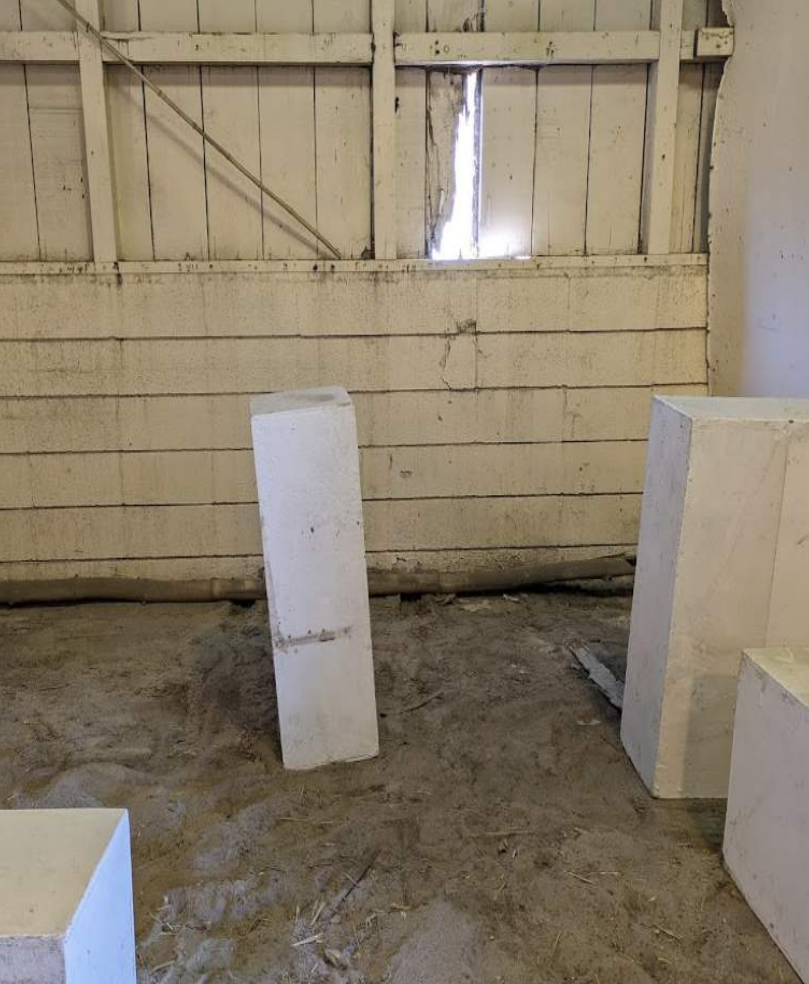
Sandy's designated "stall"