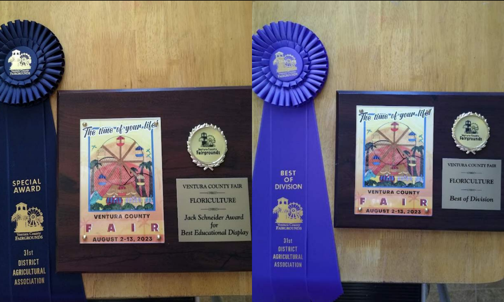
Best Educational Display