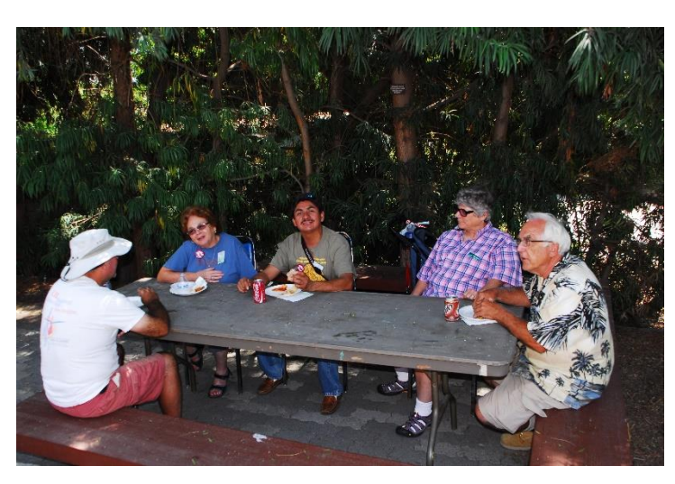
Time for Lunch